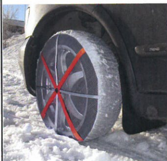
AutoSock textile tyre socks Instant grip on snow and ice Quick and easy to fit