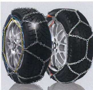
Huge range of quick fitting snow chains for cars, vans, 4x4s and trucks